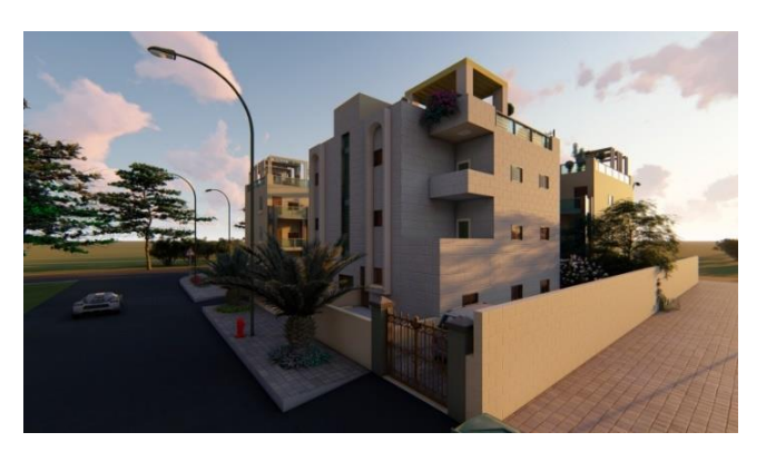
Figure 3. The four chosen palaces