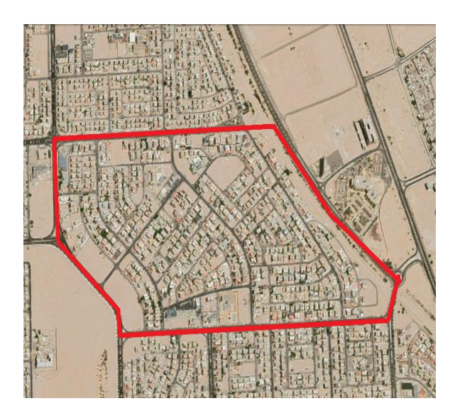
Figure 2. Aerial Satellite image of the zone 8