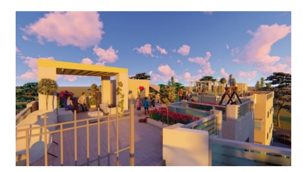
Figure 6. Spaces for socializing without limitation of contact