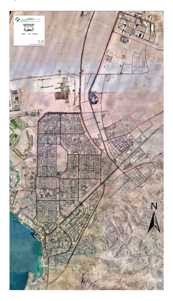
Figure 1. Satellite image of the city of Aqaba

This solution is necessary, because the spaces suitable for the courtyards and the open spaces at ground level are limited (Figure 6).