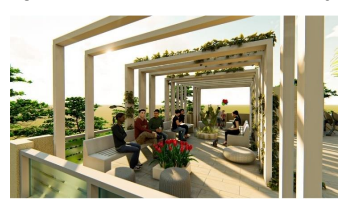
Figure 5. Spaces for socialization with and without physical contact