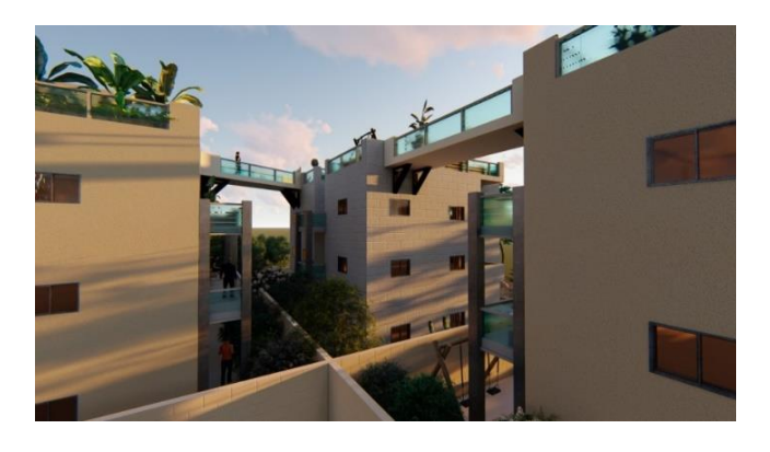
Figure 4. The connection between the four chosen buildings