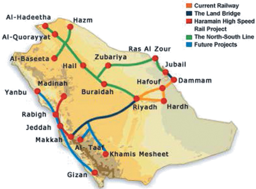
Figure 3: Intercity railway network in the KSA [6].