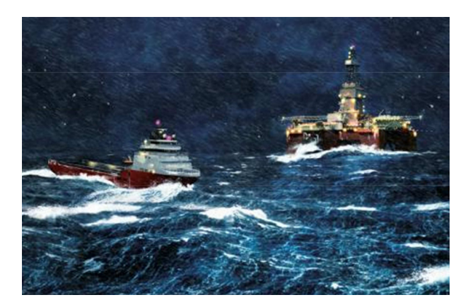
Figure 1: Freezing temperatures, icing, snow, and an unpredictable climate have a bigger impact on the operations of a platform in the Barents Sea than in the North Sea (Illustration: Ole Andre Hauge).