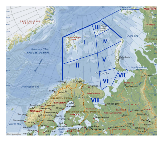
Figure 2: Barents Sea regionalization; south western Barents Sea is region II [1].

Figure 1: Freezing temperatures, icing, snow, and an unpredictable climate have a bigger impact on the operations of a platform in the Barents Sea than in the North Sea (Illustration: Ole Andre Hauge).