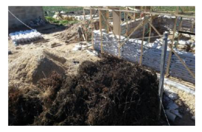
Figure 15: Collecting insulation material.