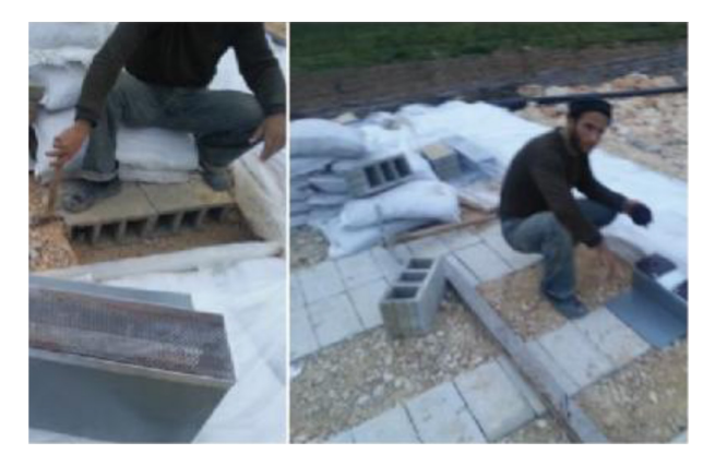
Figure 5: Earth duct outlets.