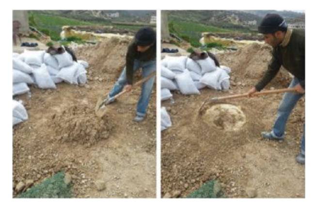
Figure 13: Testing the plaster.