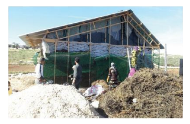
Figure 18: Filling with insulation.