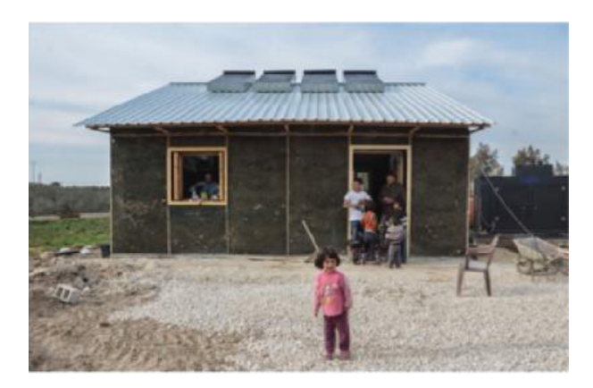
Figure 20: Completed school unit.