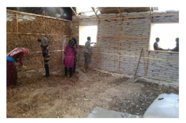
Figure 19: Refugees plaster & help.