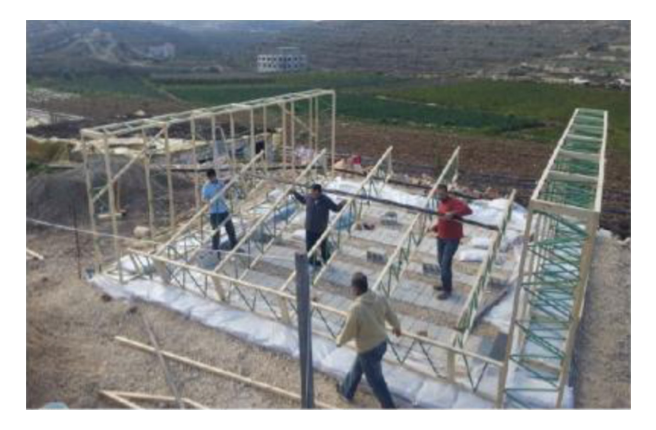
Figure 11: Assembling Eco-beams.