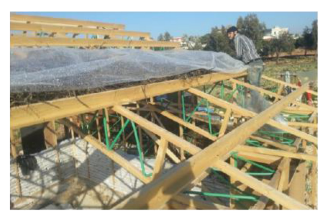
Figure 16: Installing roof insulation.