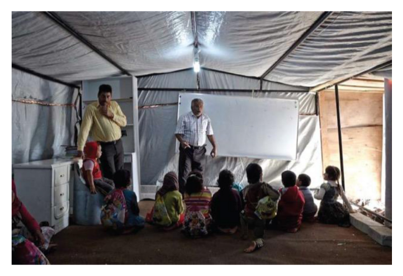
Figure 1: Example of a make-shift school inside a refugee camp in the Bekaa.