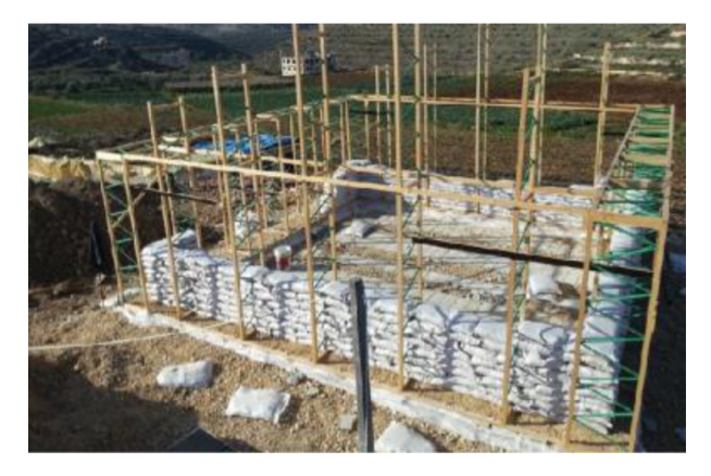
Figure 12: Sand bag stacking.