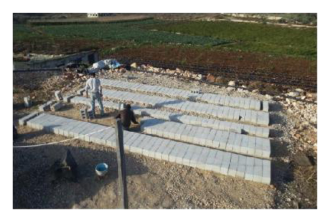
Figure 4: Assembling earth ducts.