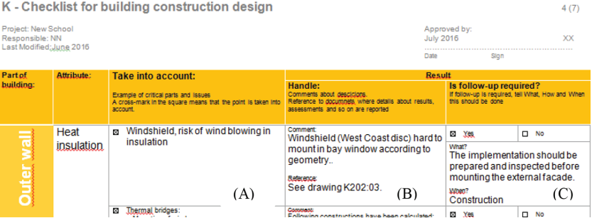
Figure 3: Example of completed checklist for building construction in the design stage.

K - Checklist for building construction design