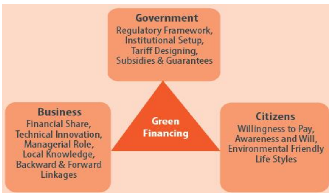
Supplementary Figure 1. Green financing stakeholders' interaction