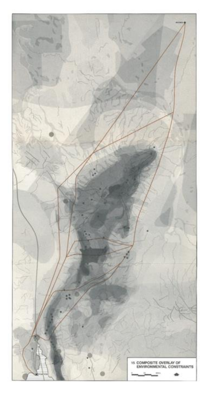
Figure 2. Composite overlay of environmental constraints [3]

Environmental constraints associated with specific sites, i.e., national parks, conservation parks, Aboriginal sites and rare species habitat, were given high ratings, not only to reflect high impact potential, but also to ensure their visibility on the final overlay. Constraints such as increased access and erodibility were given lower ratings because the impacts are more diffuse, and if darker toning were used, the contrast in tone would be lost in the composite overlay.