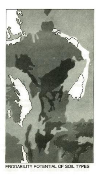
Figure 1. Constraint overlays for vegetation associations and erodibility of soil types [3]