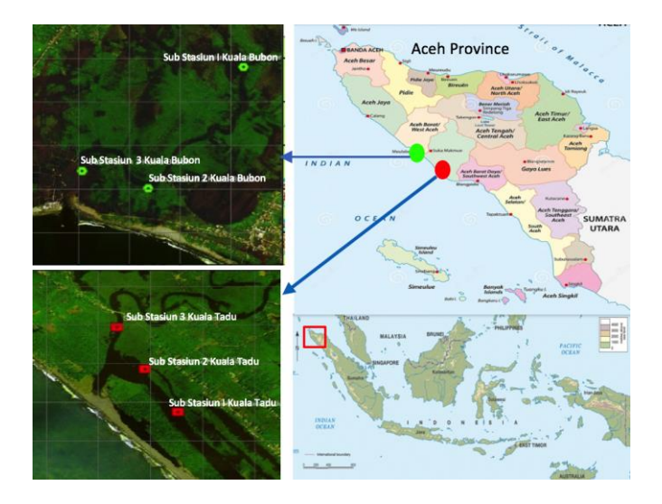
Figure 1. The map of the study area showing the sampling locations (Red dots are in Kula Tadu, green dots are in Kuala Bubon)