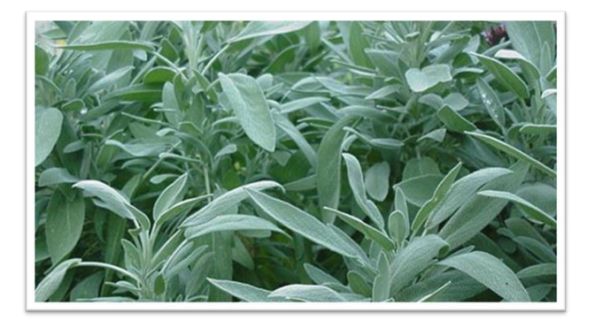
Figure 1. Salvia officinalis