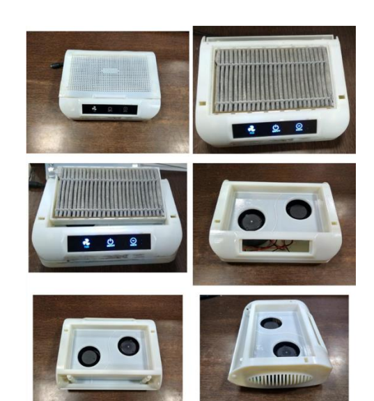
Figure 5. Fourth prototype (P4)