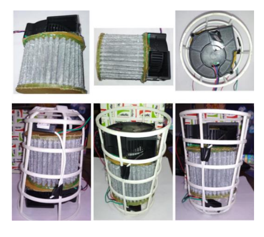
Figure 3. Second prototype (P2)