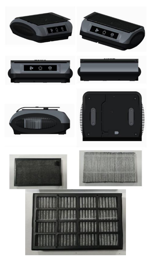
Figure 6. Final proto and filter elements