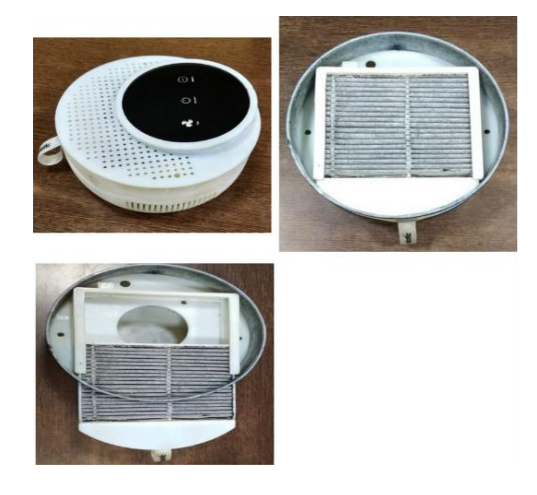
Figure 4. Third prototype (P3)