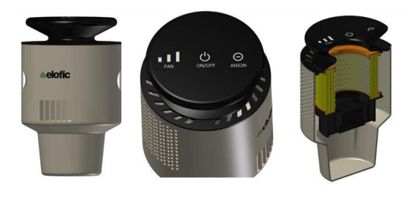
Figure 8. Future proposed design

application and environmental conditions when conducting research or using it directly. Transmission of pathogens, including viruses can be prevented using safety precautions. One can not solely rely on the products alone to prevent its spread. Treatment of cabin air pollution, including PM, viruses, bacteria and VOCs, is very important, and such products may extensively be used in buses, trucks, cars, railways and aircraft, etc. Using a proper design (as per clean air requirement) by incorporating different filtration and sterilization techniques such as UV-C, plasma air, thermodynamic sterilization etc., one can treat PM, viruses (COVID-19), bacteria and most important VOCs in vehicles. The present outcome also recommends that using such technologies in vehicle cabins, where public transport is concerned, will be very effective. Following are the future proposed design and some of the currently developed filter elements by the current R&D team (Figure 8-10).