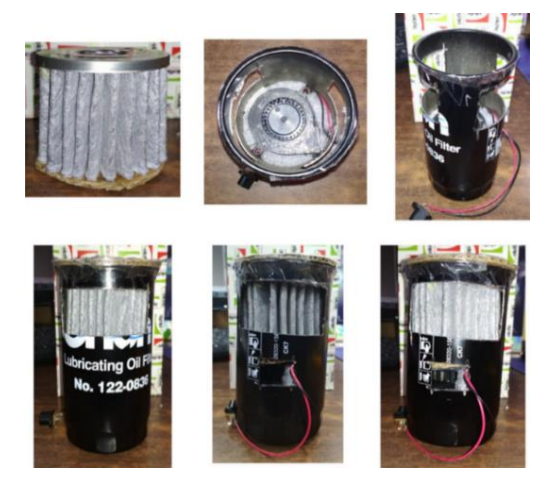
Figure 2. First prototype (P1)