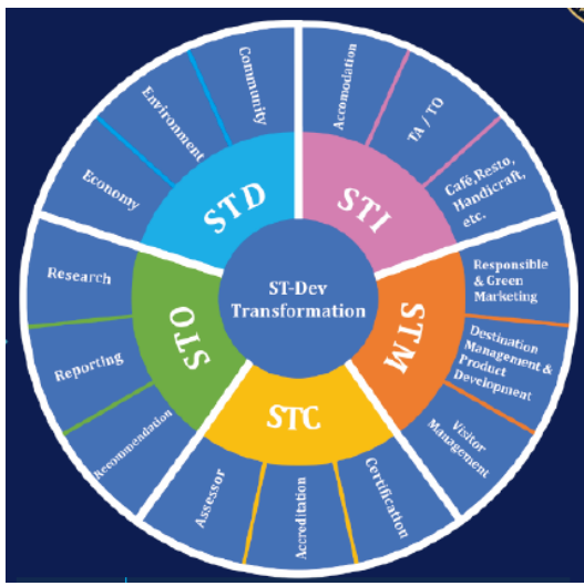
Figure 2. Sustainable tourism development in Indonesia

Sustainable tourism development (or STDev) is conceptualized and implemented in Indonesia through the establishment of three key programs: Sustainable Tourism Destination (STD), Sustainable Tourism Observatory (STO), and Sustainable Tourism Certification (STC) [38] (see Figure 2).