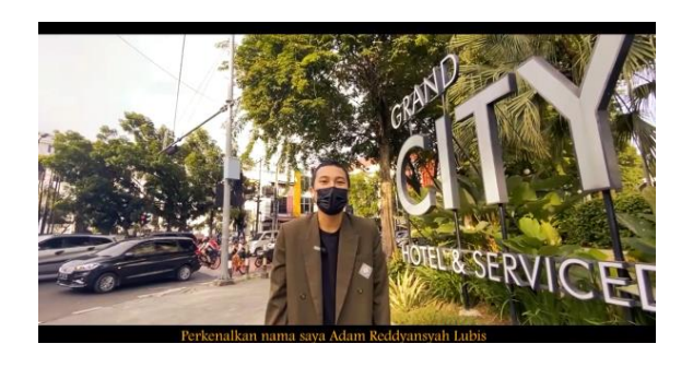
Figure 2. The opening of virtual tour

After the finishing process, a virtual travel video of 5 minutes 54 seconds was developed. Afterward, the video was uploaded on the student's YouTube account with the link: s.id/J68JL. As of November 20, 2021, the number of virtual tourist viewers had reached 1,100. Figure 2 displays a screencapture of Virtual Tour uploaded via YouTube channel.