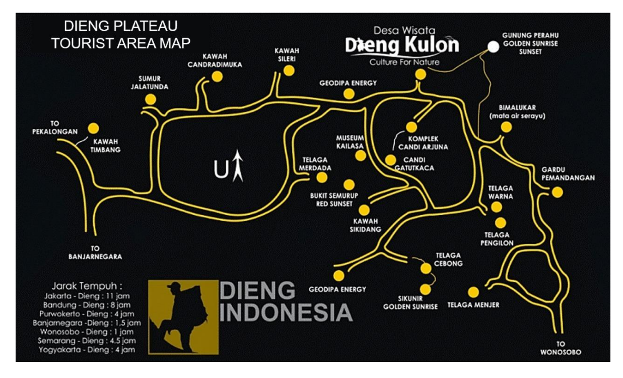
Figure 1. Tourism attraction mapping of Dieng Kulon rural tourism

From various identifications conducted through research process, the model of rural tourism development applied in Dieng Kulon that has brought success in this rural tourism can be described in Figure 2.