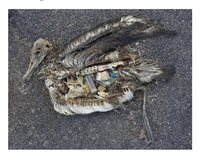
Figure 9. Bottles caps inside the bird carcass

Digital technology plays an unquestionable role in almost every aspect of modern life. As a result, legislation to address waste and pollution should also consider this digital aspect. To collect home waste, the government must establish a