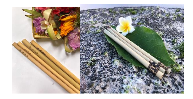
Figure 6. Examples of bamboo straws by BooBali

BooBali, a company that tries to limit the usage of plastic straws, offers bamboo straws as one of its products. Bamboo, according to Mas Nara, has a number of advantages, including its ability to conserve water. The usage of bamboo straws is intended to attract a large number of people to cultivate bamboo, which will, in turn, save water indirectly through the existence of bamboo plants. Bamboo reeds from North Bali, with a marketing area in Gianyar, are the type of bamboo used. The bamboo straws made by BooBali are shown in Figure 6.