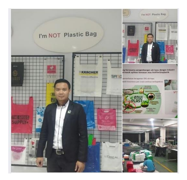
Figure 4. Examples of shopping bags made from cassava

totally phased out because there have been already a more environmentally friendly alternative.