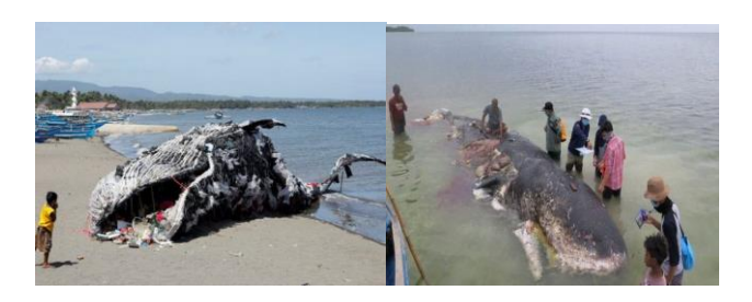
Figure 7. A whale swallowed 7 kg of plastic waste

In each district and city in Indonesia, the following sensible strategy is establishing a regular and integrated waste management system. Despite the presence of rubbish, boxes are not necessary for every regency or city in Indonesia nowadays. The government must adopt a nationwide policy mandating garbage cans on every street and sidewalk in every town and regency. In Padang, Indonesia, it would be preferable to be supplied every 15 meters on each street or sidewalk. In addition to roadways, trash cans must be available on all agencies, offices, shops, and dwellings from cities to villages. Assume that the agency, organization, city, regency, or lodging does not supply garbage cans. In that instance, a sanction such as a written warning or the withdrawal of their operating permit may be imposed.