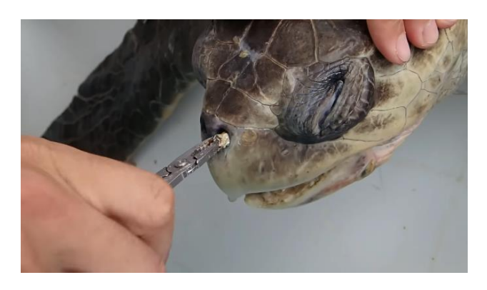
Figure 8. Plastics straw inside a turtle nose