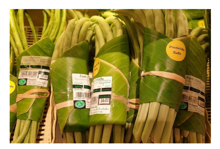
Figure 2. Vegetables are wrapped in natural materials (banana leaves) at Rimping Supermarket in Thailand

This is especially important because plastic shopping bags endanger the ecology and nature's preservation. According to Euromonitor (2019), over 10 million tons of plastic are dumped in the water each year. It also reveals that scientists from the University of Georgia's National Center for Ecological Analysis and Synthesis calculated that 8 million tons of trash entered the sea each year in 2010, with forecasts that this number will rise to 9.1 million tons by 2020 [30]. Faced with this problem, many countries around the world are now promoting the use of natural materials such as paper, cloth, and leaves for shopping. In one of Thailand's shops, here is an example of how raw materials are used to pack vegetables.