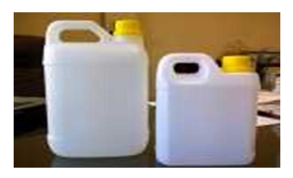
Figure 5. Example of jerry cans for liquid products

The policy connected to replenishing food and home products in liquid, powder, or flour in stalls, shops, minimarkets, and supermarkets, is the following wise policy presented as a solution to the waste problem and minimizing plastic materials in the society. Although this regulation appears to be outdated, it is a viable option for reducing plastic waste. Because supermarkets and stores utilize a massive amount of plastic packaging to pack sugar, flour, oil, biscuits, snacks, and other items, it is easy to envision how much plastic can be raised or decreased whether this regulation is implemented or not. This regulation will prohibit the use of disposable plastic packaging for liquid, powder, and flour goods. Buyers must instead bring their containers to the stores, such as bottles or jerry cans. The community will be able to make numerous plastic savings as a result of this.