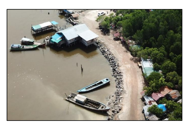
Figure 3. The revetment building with a dump stones system in Bandar Bakau Dumai

This study has identified at least 5 (five) disaster mitigation activities that have been implemented in Bandar Bakau Dumai, namely: 1) construction of cliff protection (revetment), 2) mangrove restoration, 3) construction of eco-tourism facilities that adapt to the natural environment, 4) coastal education, and 5) counseling on the potential of eco-tourism as disaster prevention. The first three activities are more of structural mitigation, and the last two activities are non-structural mitigation. In line with the research [31] identified seven subelements of natural disaster mitigation in the Indramayu and Ciamis coasts, including the making of legislation and standard norms for manual procedures, socialization, selfrescue systems, assistance for standard building construction, early warning systems, combined mangrove restoration - coral reefs-beach revitalization, as well as a combination of breakwaters-abrasion absorbers-sedimentation-retaining moving parallel to the coast.