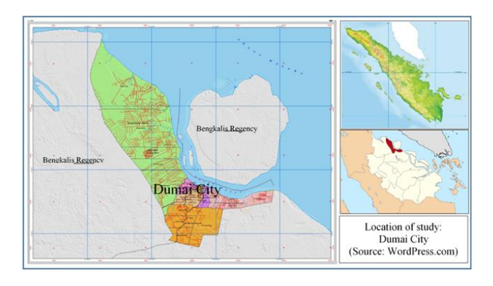
Figure 1. Dumai city map, Riau

The research was conducted from June to November 2020 in the Mangrove Ecotourism Area of Bandar Bakau, Dumai City, Riau. Dumai city, located on the east coast of Sumatra, is the busiest port city in Riau Province. Dumai has unique beach characteristics with brownish-yellow sand, also has a mangrove ecosystem with a diversity of biota as an attraction for tourists. Literature [15] shows that the direction of tourism development in Dumai City favors natural, historical, religious, sports, culinary, and shopping tourism. Literature [16] has exposed at least 14 exciting tourist attractions in Dumai City (Figure 1).