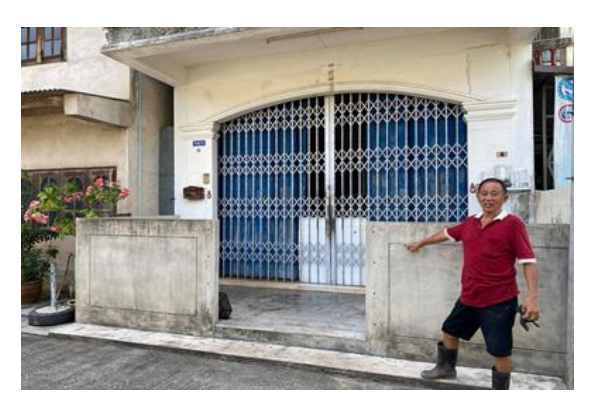
Figure 4. Flood barriers were constructed to prevent the water flow in PTSM