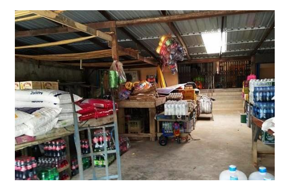
Figure 3. Storage of belongings on higher platform in Patong Market