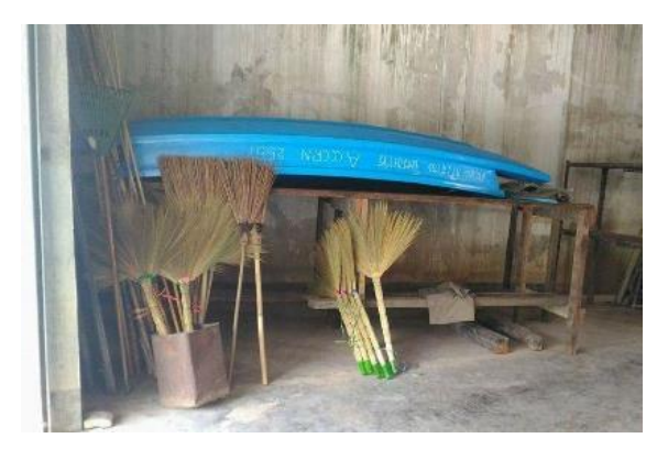
Figure 5. Boat kept under the house in PTSM

3.4.3 Climate change adaptation on agriculture