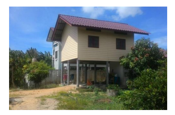
Figure 2. Stilted-house in KHTM

adaptation choices in U-Tapao River Sub-basin. Figure 2 illustrated the entire house being raised according to the estimated highest level of flood-water in the past. Figure 3 showed the non-permanent replenishment of the kiosk's inventory. Figure 4 showed the concrete structure that was adapted to the existing house to prevent floods.