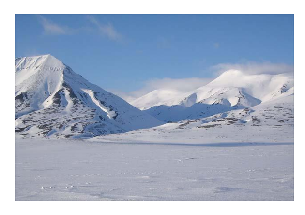
Figure 9. Cold desert

All deserts are created because of little rain or snow over long periods of time (Figures 8 and 9). There are various factors responsible for the lack of precipitation. Hot deserts are greatly impacted by high pressure systems at the tropics. The rain shadow effect is one of the more significant factors that influence the desert formation.