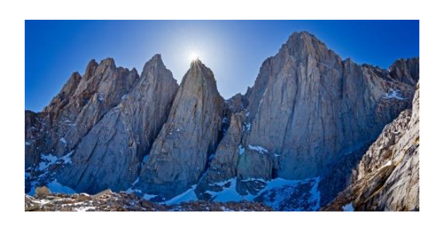
Figure 3. Mountains landscape Scene © 2020 ATLAS & BOOTS LTD