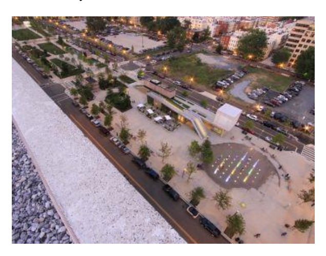
Figure 17. Parking lot for School buses in Washington, D.C. (Before) © OLIN

fountain, pools, and the splash pad. Also, the park's vegetation is mostly native to the Washington, D.C. region, which is easy to make them grow in the same atmosphere, and they are feeding the local birds and other animals in the city. The park has 28 geothermal walls, which help to control the temperature of the indoor spaces, and the pavement is designed with appropriate materials and forms to not increase the thermal heat. Besides, people use to come to the park in all year's season to sit on benches, lie on the lawn, and hang out with friends or family.