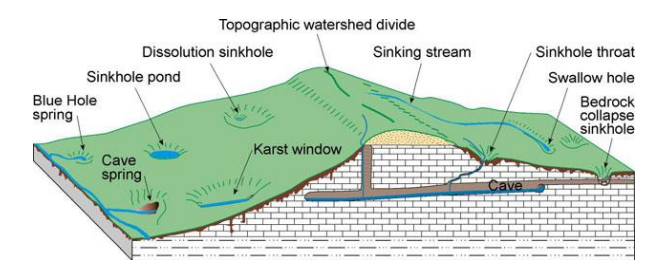
Figure 10. Demonstrate the tectonic of the Karst

Karst is a topography formed from the dissolution of soluble rocks such as limestone, dolomite, and gypsum (Figure 10). It is characterized by underground drainage systems with sinkholes and caves (Figure 11).