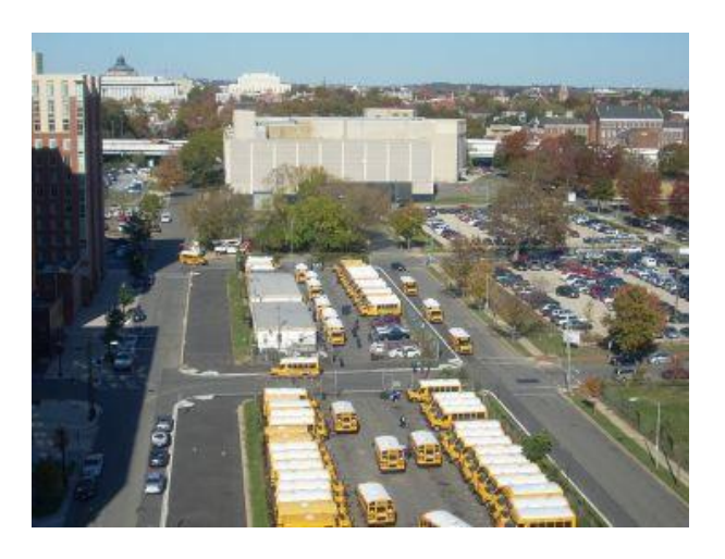
Figure 16. Parking lot for School buses in Washington, D.C. (Before)