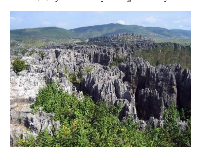
Figure 11. Characteristics of the Karst