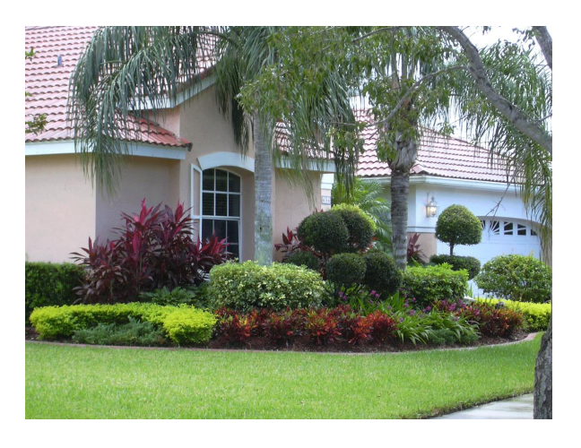
Figure 21. House front yard in Florida, AZ