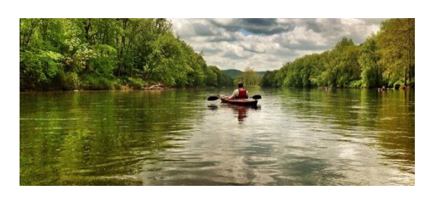
Figure 6. The relation between the river and surrounding © 2020 Pariver of the year