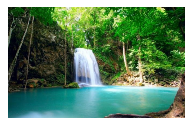
Figure 13. Forest features