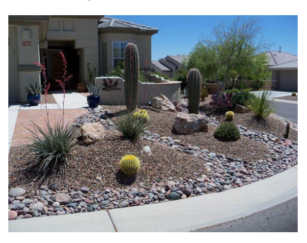
Figure 20. House front yard in Tucson, AZ