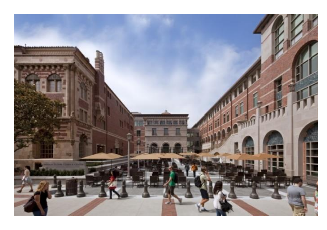
Figure 19. University of Southern California campus, walkway front of Student Union

The vegetation is much better if it is from the same territory since each plant grows naturally in its native area. It is hard to take trees from the rainforest and plant them in a desert region that has low precipitation. This plant increases water consumption, and it could fail because the tree might do not tolerate the new climate. For example, most people in Arizona state use the local plants, which not consume much water since they grow in the desert, and rocks or stones (Figure 20), while people in Florida state use high water consumption plants since Florida is a rainy and humid region (Figure 21).