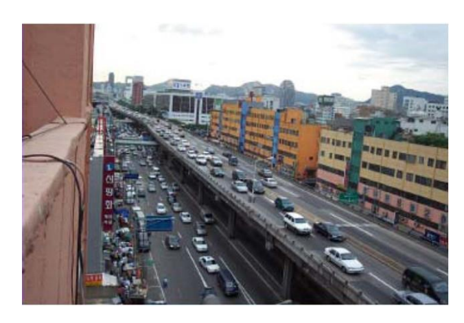
Figure 14. Highway above Cheonggyecheon water stream in Seoul, South Korea (Before)

Infrastructure is defined by daily human needs such as buildings, roads, transport, energy, sewerage, water stream, and telecommunication systems—an example of the infrastructural landscape which works with the geographical location, especially with terrains and water streams. ChonGae Canal Park in Seoul, South Korea, which is designed by Mikyoung Kim and her firm, Mikyoung Kim Design in Boston, Massachusetts, is a great example of reopening a water stream along a seven-miles path through town. By the 1960s, the Cheonggyecheon stream in Seoul was contaminated by the four-lane highway that was flying over it (Figure 14). In the 2000s, the city's mayor, Lee Myung-bak, was concerned enough to destroy the highway and restore the stream to be a public place that can carry many events and festivals (Figure 15). The water level varies between hourly and daily depending on the time of year and amount of rainfall, but most days, almost 22000 gallons come from storm drains and the subway system.