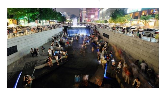
Figure 15. ChonGae Canal Park in Seoul, South Korea (After) © 2020, mikyoung kim design