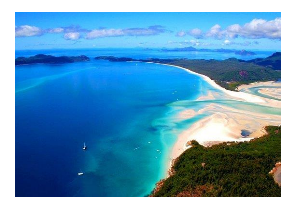
Figure 4. Showing the features of Costal landscape

A costal geography is formed by land attachment; it is shaped by winds and waves that can be observed at in beaches, oases, ...etc. (Figure 4).