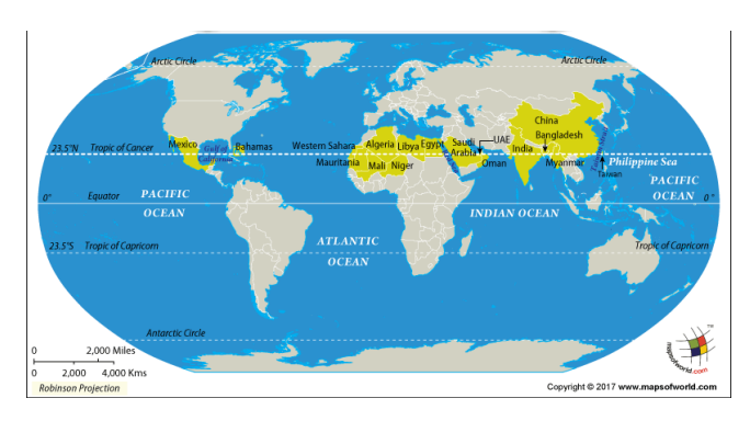
Figure 7. Illustrate latitudes, and the countries around the tropics of Cancer

Deserts are the areas of earth that do not receive more than 250 mm of rain per year. There are two types of deserts: hot deserts which are located along the tropics of Cancer and Capricorn and cold deserts which are near to the Arctic and Antarctic Circles (Figure 7). These areas have little vegetation, due to a lack of rain, and they feature sand, rock, and gravel.