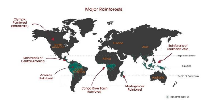
Figure 12. Show the Equator latitude and rainforests Map