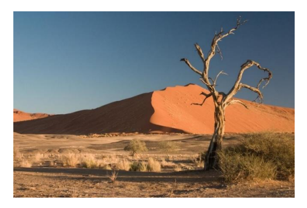
Figure 8. Hot desert