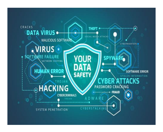
Figure 2. Cyber security threats

From Figure 2, cyber-security risks have continued to develop and, as a result, have taken on a new shape, according to the literature. According to Wanyoike et al. [5], 430 million new malware pieces were found in 2015, a 36 percent rise over 2014. With the increasing rate of technology adoption by small businesses, these statistics leave them highly vulnerable.