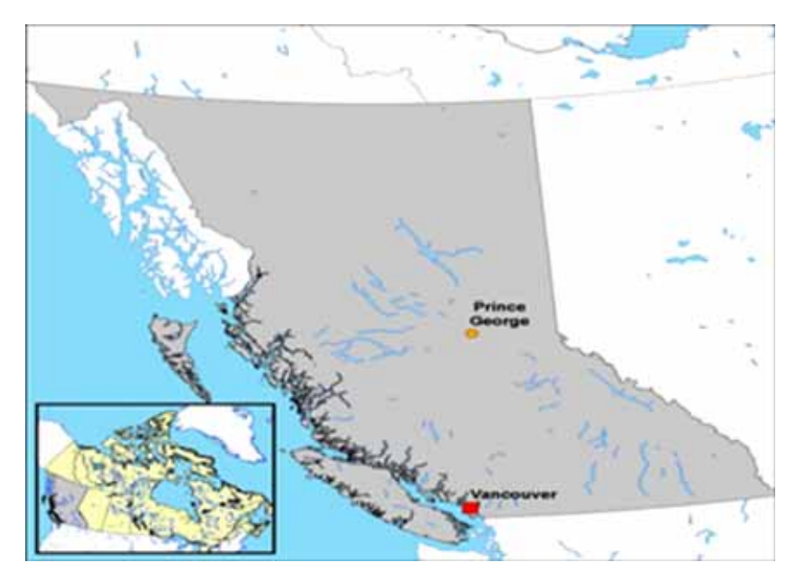
Figure 1: Locator map of Prince George within Canada.

forest products enterprises consolidated into large processing and manufacturing operations. During this period of rapid growth, low-density development with large lot sizes dominated, resulting in significant sprawl with a heavy dependence on the automobile to move across the urban landscape [4]. Prince George is traditionally a logging town and still has a large dependence on the forest sector for economic activity. The City is trying to capitalize on its geographical location and become a hub for trade between Western Canada and Asian markets. The emergence of Asian markets and the faltering U.S. economy has led to an increased emphasis on Asia as a future trading partner. Prince George struggles to balance its dependence on resource development for economic activity and maintain a strong community in which residents can access outdoor recreational activities and appreciate a connection with nature. Many local governments in BC (and around the world) struggle to reconcile their reliance on extracting and exporting natural resources for economic growth, and local interests in environmental and social sustainability. The development of an ICSP presents an ideal opportunity to begin addressing the challenges of balancing growth, trading opportunities, environmental health, and community connections in Prince George.