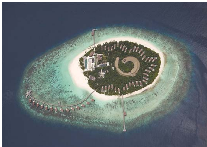
Figure 1: Hadahaa Maldives (Hyatt Park Hilton).

Also crucial are the economic components supporting the project. In the case study, the background was a $(Aus)40 million medium-sized resort creating 14 Aqua Villas and 36 Island Villas of which 20 have individual small pools. Of the two restaurants, opened one specializes in Maldives cuisine. The leisure concierge service provides access to all island activities and excursions most with a strong accent on cultural experiences. The developer and the facility managers of the constructed and operational project are experienced people who own and operate a number of resorts in the Asia Pacific Region respectively.