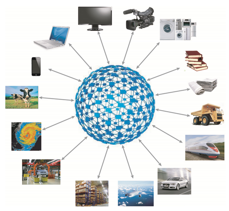
Figure 2: The global network.

about us will try to use this knowledge to manipulate our behaviour. Knowledge is power. Who will exercise this power acquired by accumulation of digital data about every aspect of our life? Will a private company (possibly in collusion with a government intelligence service) manage to acquire sufficient quantity of data to establish monopoly of knowledge? Or, can we expect that the process of natural selection will ensure the distribution of knowledge? It is safe to be an optimist. Evolution favours complexity, which implies diversity and distributed decision-making rather than centralisation, although the process is slow and by no means smooth.