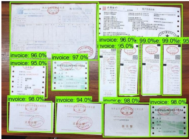
Figure 3. The classification effects on multiple instrument areas

contributes to the superiority of our method: the final classification model is optimized through parameter finetuning on each layer by backpropagation algorithm.