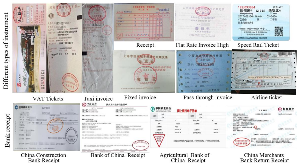
Figure 2. The different types of financial instruments

(2) The image quality varies significantly (Figure 2), under the effects of multiple factors, namely, the quality of instrument, the model of collection device, technical differences, and factors in accidental collection. The main defects of image quality include wear, deformation, wrinkling, character overlap, tilt, obscuration, incompleteness, and complex background with uneven lighting.