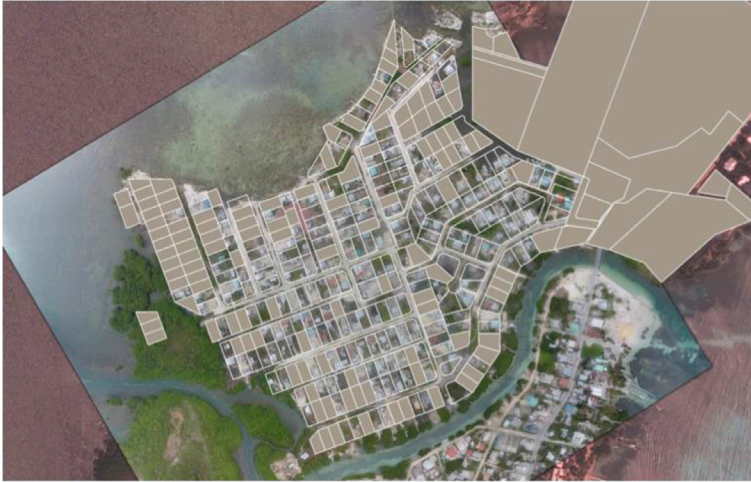
Figure 4: Vacant lots are indicated by grey fill. Some of these lots may have structures, but they are unoccupied. All other lots have residents present.

the absence of a predictable trend of vacant lot orientation, they give insight into the community's origins and future growth trends. The center of San Mateo accommodates the preponderance of the occupied lots, while vacant lots are in greater numbers along the coast or where copious inland water has yet to be displaced. Vacant lots are common along the waterway on the lower constraint (Fig. 4) or along the water in the upper right.