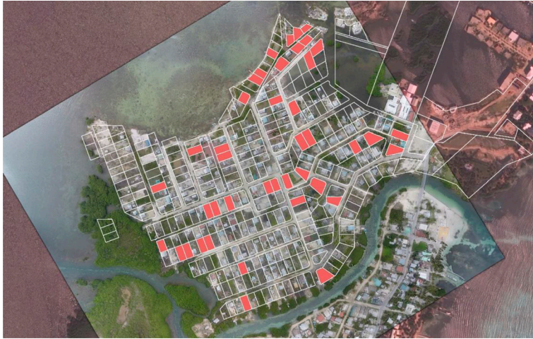
Figure 3: Lots colored in red indicate those without access to electricity.