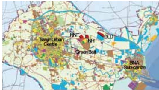
Figure 1: Location of study cases on the metropolitan map of Tianjin.