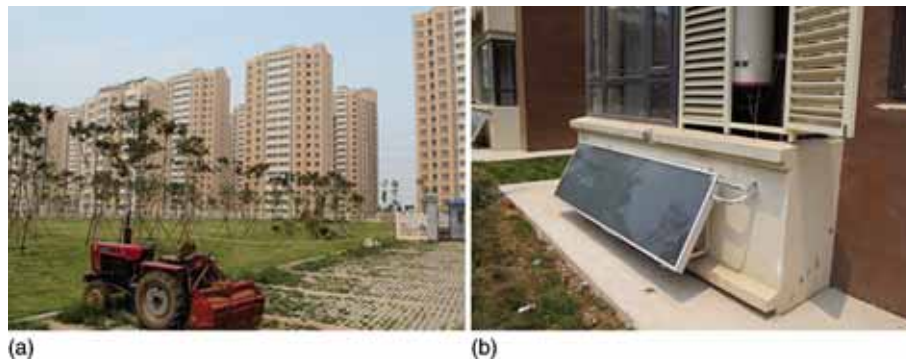
Figure 3: (a) Huaming New Homes: completed but largely unoccupied (photo taken by the author). (b) Solar collector fitted on balcony (photo taken by the author).