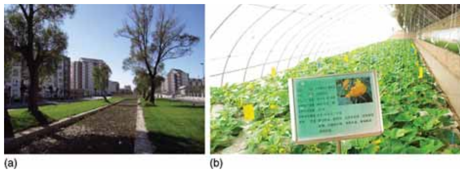
Figure 2: (a) Huaming New Town: modern residential building blocks amongst preserved farm-edge trees. (b) Re-cultivation of former zhajidi with greenhouse farming.