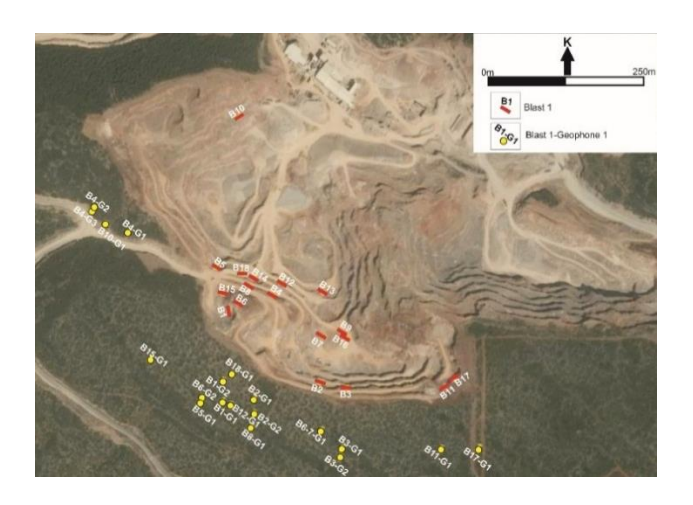
Figure 2. Location of blast areas and measurement points

Sampling refers to the process of selecting a part that reflects all the characteristics of the universe that forms the subject of research. The sample is a small part of the whole from which it is chosen. Studies conducted by selecting samples are economical in terms of time and cost, and can often be as valid, healthy, and reliable as the results obtained by examining the whole stage [21]. In this study, attention was paid to the sample's representation ability and its statistically sufficient size.