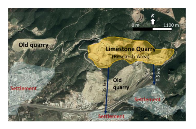
Figure 1. Location of limestone quarry

Melange rocks are extremely folded and fractured. The Upper Cretaceous-Paleocene age Bornova Melange rocks exposed in the Izmir Metropolitan mainly consists of conglomerate, micritic limestone, Bornova Flysch and limestone olistoliths. Bornova Melange rocks were formed in flysch facies [18-20]. In the quarry site where the blasting occurred, limestone olistoliths of the Bornova Melange are exposed. The oldest one is dolomitic limestone. The contact between rudist bearing Cretaceous limestone and the dolomitic limestone is diachronic. The Miocene age sedimentary rocks overlie all geological units with unconformity. Volcanic rocks unconformably overlie Miocene sedimentary rock around the study area.