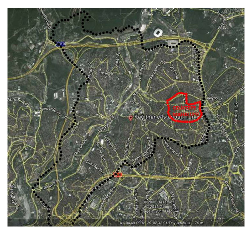
Figure 1: Çeliktepe's location in the Kağıthane district.

The population of Kağıthane was 419,865 in 2011. Over the years, Kağıthane's share in the overall population of İstanbul has increased. Its migration history explains how this district has transformed from a small village to a city district in such a short period. Çeliktepe is one of the destinations that receive the most immigrants in İstanbul. Altınok [15] evaluates the meaning of Çeliktepe's particularly strategic position in İstanbul in the context of this historical process and identifies the stages of this neighborhood's process of urbanization. In the 1950s, Çeliktepe was administratively considered a 'village.' The village of Çeliktepe gained advantages with the implementation of industrial complexes and the first social housing projects. Due to the changes in the area, empty lots were put on sale and land speculation began in Çeliktepe.