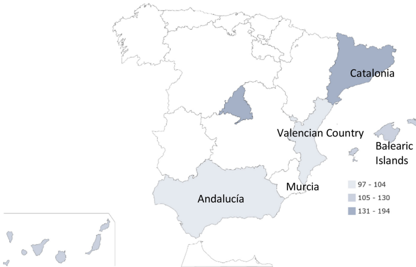
Figure 2: Average daily spending per tourist (euros per tourist per day) for different regions of Spain, 2015.

An important issue to consider is the type of activity that tourists engage in during their stay. For the Valencian region [12], the percentages of Spanish tourists involved in the main activities are: