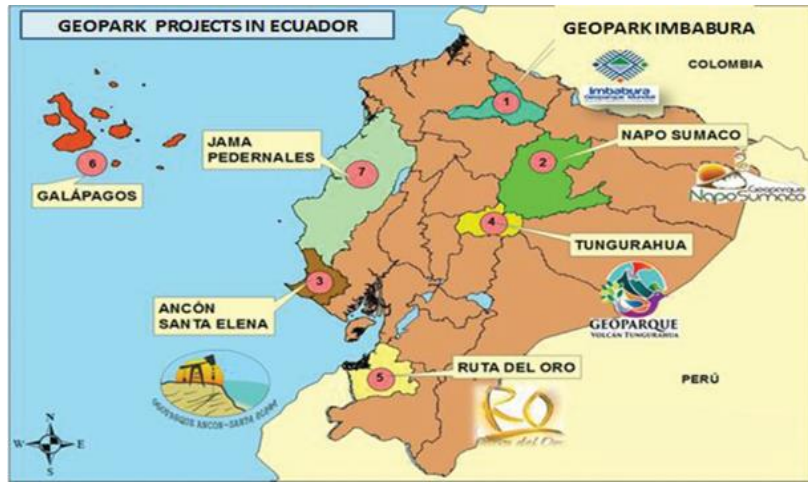
Figure 5. Geopark projects in process of acceptance and Geopark Imbabura currently designated by UNESCO [16]

The economic development that the site offers should have a direct impact in the area for the stimulation of small businesses and innovation initiatives, education is also rescued since through this organize activities and dissemination tools can be accomplishing to encourage the geoscientific knowledge to the public and mainly to promote scientific research where success will depend clearly on the contact between the managers and the community, since it is important for those places to benefit from the adequate protection measures following the legislation and nature conservation regulations of the country.