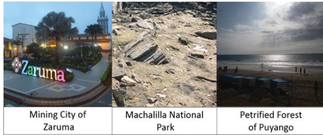
Figure 4. Photographs of the main places eligible for world heritage presented by Ecuador

Table 2 and Figure 4 and summarize the information in an organized manner to demonstrate the context of all candidacies presented to UNESCO before reaching the name of heritage.