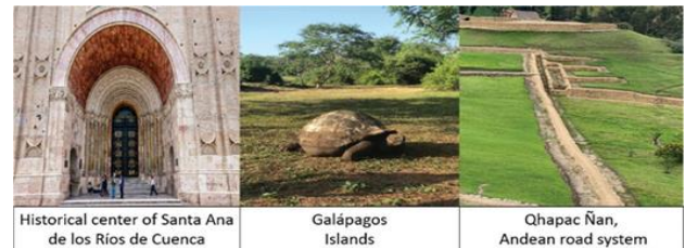
Figure 3. Photographs of the World Heritage of Ecuador recognized by UNESCO

Figure 3 and Table 1 detail the information of the eight existing world heritages, along with the dates in which they were designated and the denominations reached by each one.