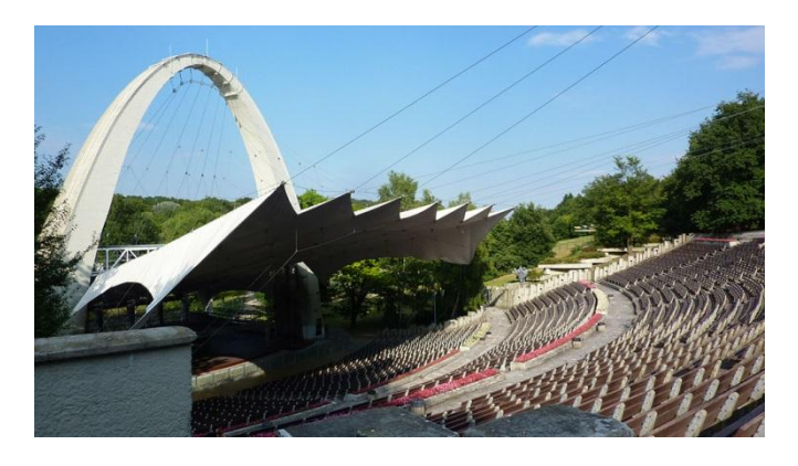
Figure 1. Summer Theatre in Kasprowicz's Park in Szczecin

building materials. His favorite material was timber, which he loved to work with in his workshop. It is crucial to mention difficult socio-economic conditions for building in Poland under communist government (1945-1989), especially scarcity of means and shortages of building materials, limited or lack of access to modern building technologies and equipment or even financing mechanisms. The main client for collective housing buildings and housing estates as well as for public buildings was the state. It is only in the early seventies when government ban of building was removed from it the Catholic Church entered the stage as client for plethora of brand-new church buildings in the coming 30 years. (For more info on polish modern churches, see project Architecture of the VII day [5]). Designing and building individual single-family houses was an exclusive, almost niche activity as most of houses were built based on standard, catalogue designs.