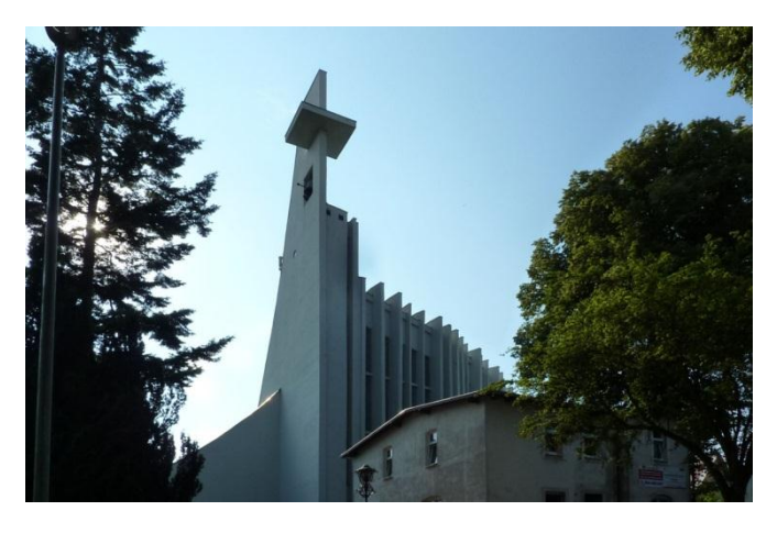
Figure 2. St. Cross Church in Szczecin