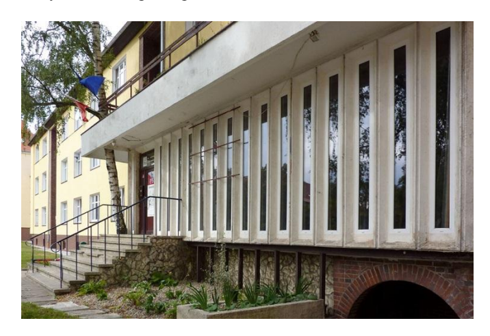
Figure 3. Former Wedding Palace in Szczecin. Building embracing a tree

Another extension project was the entrance part to Wedding Palace on Mickiewicz Street (Figure 3). This modern structure incorporated or generously embraced with its cornice part a birch-tree, which was growing on the site. The tree could be easily removed – back then nobody would hesitate to cut it down without any consideration, but provision for it was made early in the design stage.