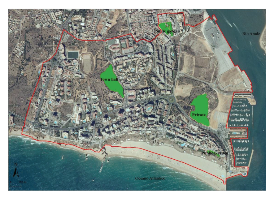
Figure 4: The study area of Rocha Beach whit the useful green areas.

Another important aspect in that have attention is the evolution of the transformation of natural landscapes, is the fact of Boa Viagem Beach (Fig. 3). The urban vertical growth was rapid and destroyed the coastal landscape. The mangrove swamp disappeared, with the years