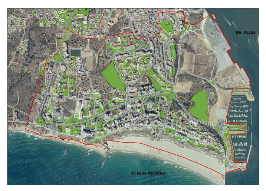
Figure 2: Green areas in study area of Rocha Beach.