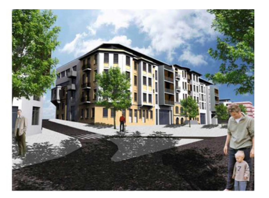
Figure 3: Existing neighborhood structure and proposed spatial project in historical district.