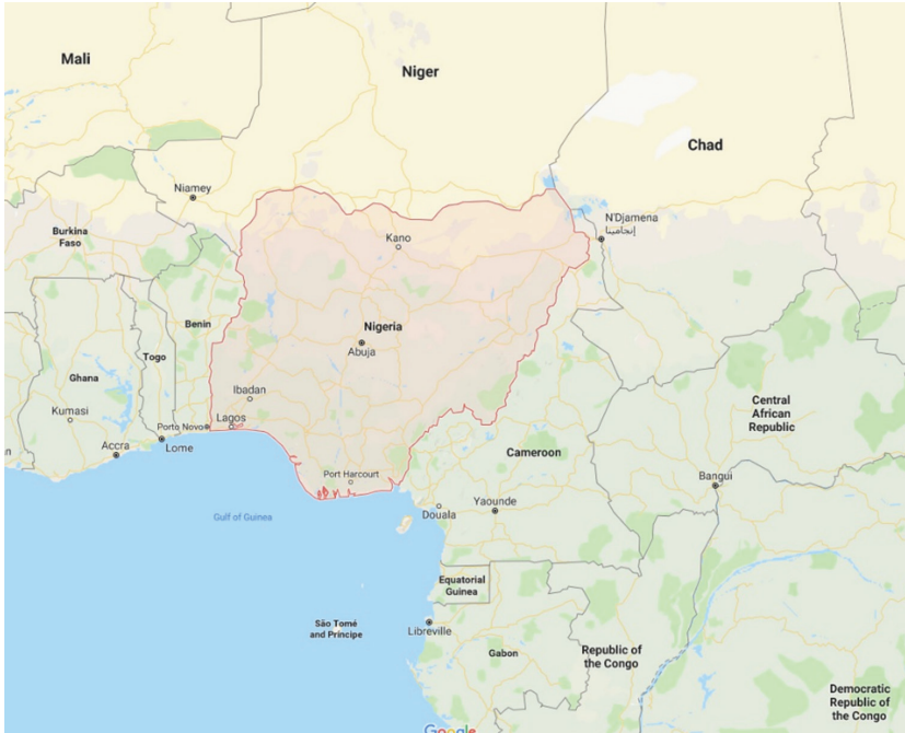
Figure 1: Location of Nigeria in Africa.