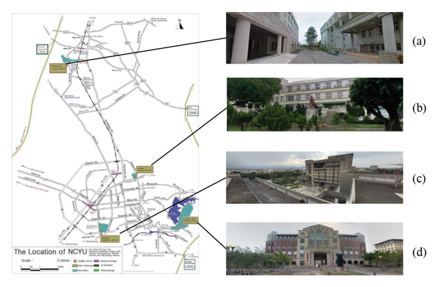
Figure 2: Location map of the four plazas in front of the central libraries in National Chiayi University campuses. (a) Campus Lantan; (b) Campus Minsyong; (c) Campus Linsen; (d) Campus Sinmin.