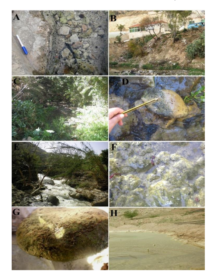
Figure 2. Field photographs of Wadi Shueib. (A) Sampling site 1 with theodoxus and melanopsis snails; (B) Macroinvertebrate's collection Site 2; (C) Site 3, stream with well vegetated banks; (D) Physa acuta gastropods with their egg cases in Site 3; (E) Swift running freshwater Site 4; (F) Aquatic tubificid worms in muddy water (Site 4); (G) Blackfly (Diptera: Simuliidae ) larvae in Site 4; (H) Small ponds of Site 5

During the field campaign in 2021 and 2022, material of aquatic invertebrate assemblages was sampled and studied throughout these study sites. During the field trips different invertebrate groups were observed and collected mainly encompassing Ephemeroptera (Mayflies), Odonata (Dragonflies), Gastropods (snails), Annelida (Oligochaetes tubifex, leeches, turbellaria), Diptera (black fly Simuliidae, Chironomid midge), and others. Five sites were sampled and selected based on the alteration of macroinvertebrate assemblage along the Wadi Shueib. Running fresh water flow about 20 km from the highland of Salt city to Wadi Shueib Dam at the entrance of the wadi to the Jordan Valley.