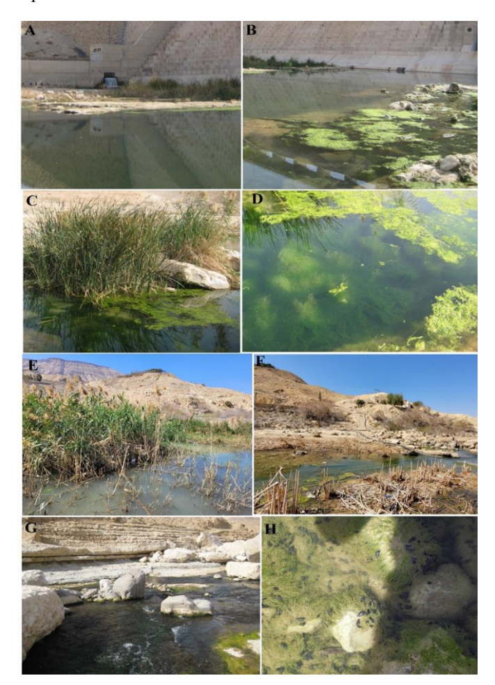
Figure 3. Field photographs of the study area in Wadi Mujib. (A) Site 6 at the outlet Wadi Mujib Dam. (B) Site 7 is covered by algal mats. (C) Site 8 consists of a stagnant, turbid water and surrounded by common reeds. (D) Different species of microorganisms were observed in Site 8. (E) Site 9 with absences of algae mates. (F) Fresh water stream (Site 10). (G) Fast running water over a stony ground with algae covering the edges of the stream. (H) The occurrences of melanopsis and theodoxus in Site 11

Finally, before the entrance of Wadi Mujib into the Dead Sea (Site 12), the river is fast flowing over a stony substrate. Occurances of Melanopsis are reduced and rarely found while theodoxus disappeared, Baetis monnerati mayfly declined, and aquatic Simuliidae and fish were noted in this site.