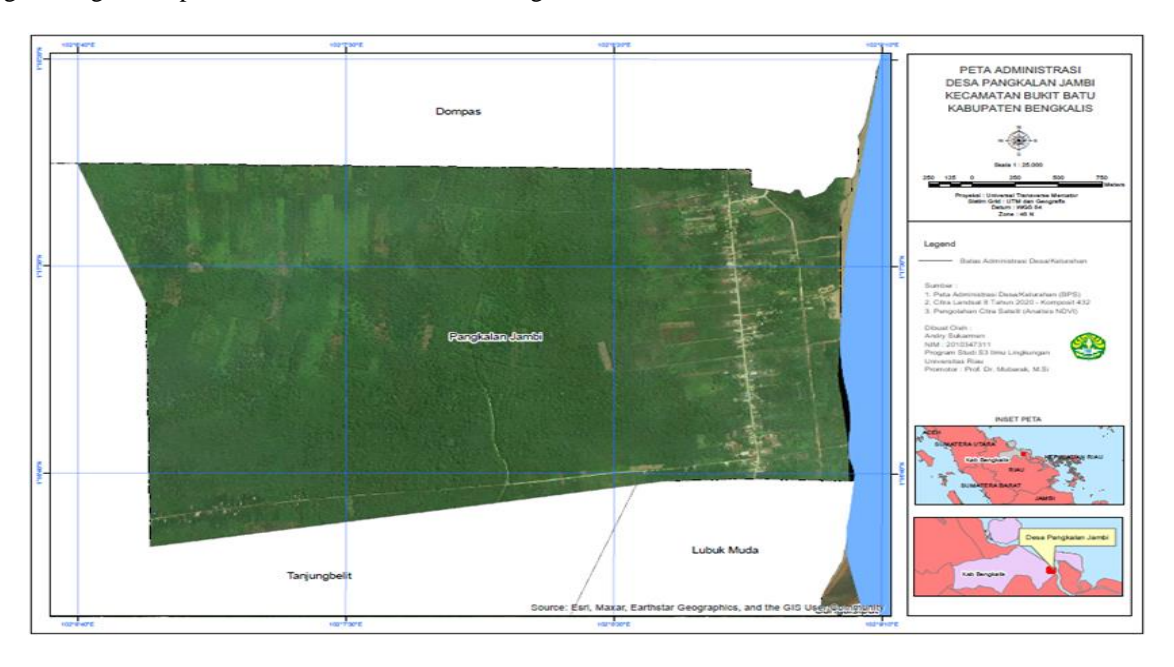
Figure 1. Administrative map of Pangkalan Jambi Village, Bukit Batu District, Bengkalis Regency

The time of the research was carried out in 2022. The research location was in Pangkalan Jambi Village, Bukit Batu District, Bengkalis Regency. The research location can be seen in Figure 1.