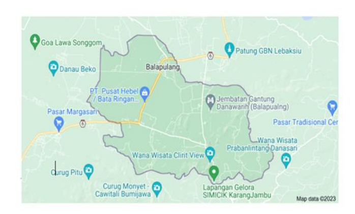
Figure 2. Map of research location

Participatory Development Planning at the village level as a stakeholder communication forum representing the community at the grassroots level to discuss and agree on the results of meetings at the neighborhood and hamlet levels.