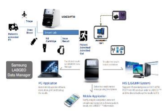
Figure 3. The operation of the Samsung smart blood analyzer LABGEO PT10

We used the Samsung smart blood analyzer LABGEO PT10 to evaluate our proposed trust degree and trust compu- tation. The latter was connected to a local PC for efficient database management and automatic software updates. The LABGEO PT10 clinical chemistry analyzer uses dry film chemistry to eliminate liquid waste. Rapid test results (7 minutes) Up to 14 analytes simultaneously using 70 L whole blood Analytical performance is comparable to the central lab mainframe [49]. The operation of LABGEO PT10 [50] is presented in Figure 3.