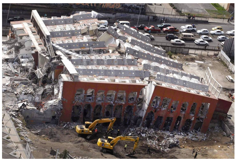
Figure 1: The most emblematic image was the fall of a building in the city of Concepción [10].

Figures 1 and 2 show some emblematic images of the earthquake that occurred in Chile on February 27, 2010.