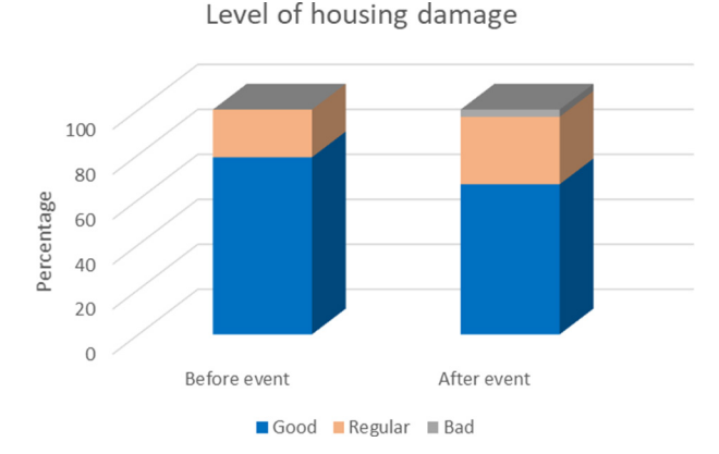
Figure 5: Percentage of homes by the level of damage at both points in time.