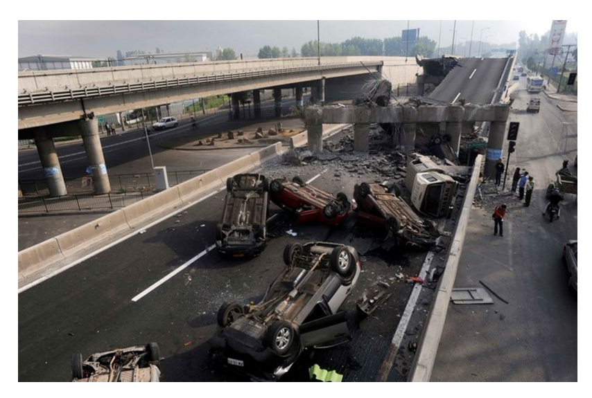
Figure 2: The earthquake prompted a major change in building regulations [11].