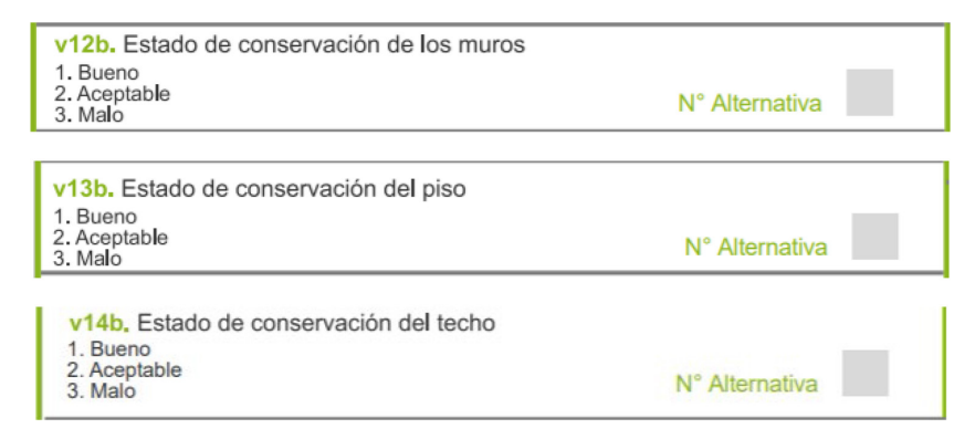
Figure 3: 2009 CASEN survey housing module questions.