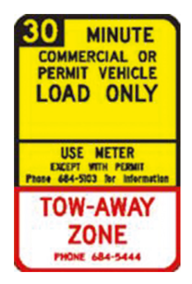
Figure 1: Typical commercial vehicle loading zone (CVLZ) signage [11].

The National Association of City Transportation Officials (NACTO) is a non-profit association of major North American cities that publishes design guidelines for various urban planning elements and modes such as bikes, transit and freight [14]. NACTO acknowledges that the operational envelope required for comfortable and safe movements is different for all modes, and that freight requires additional space for hand and cart movement. One of the freight delineations is for commercial vehicles and light trucks, which are defined as 'trucks generally used for carrying goods from ex-urbanized logistic centers to the city'. NACTO