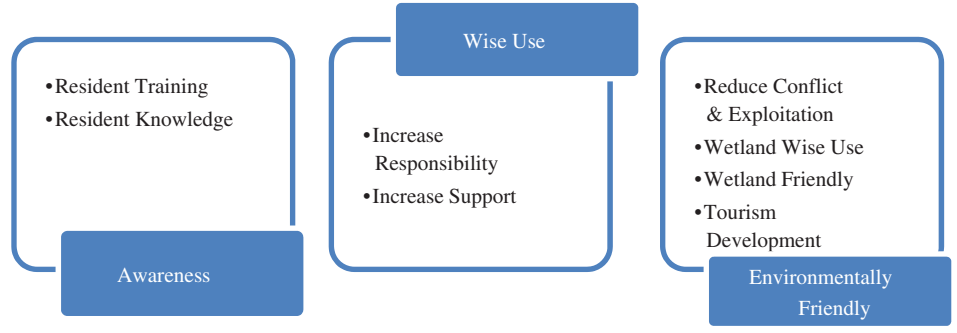
Figure 1: The different dimensions of the wise use of the wetlands. Source: [27].

To clarify this statement, a framework of the awareness of the local communities on the wise use of wetlands is prepared (Fig. 1) with three dimensions that can complete the relationship between local communities and the wise use of the wetlands. These dimensions include 'awareness as described previously by the residents' training and knowledge in the local community'. The second part is 'wise use with increasing responsibility and support of the wetlands'. The third part, 'environmentally friendly', includes different aspects such as reducing the conflict and exploitation between local communities/tourists and the wetlands, ensuring the wise use of the wetlands, interacting in a friendly manner with the wetlands, realizing their potential benefits, and promoting tourism development and exercising the wise use and 'sustaining utilization' concerning the wise use of the wetlands.