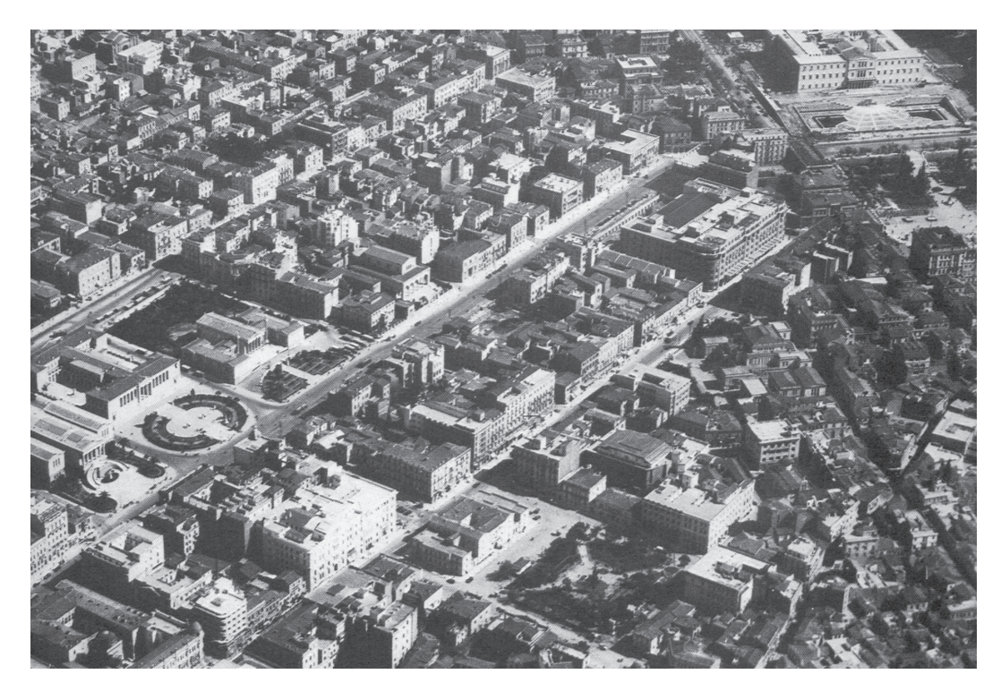
Figure 1: The central district of Athens (1932) as a result of the implementation of the planning for the new capital of Greece 1833–37 (Kleanthis, Schaubert, Klenze, Gaertner, Hoch).

19th and the early 20th century, establishing a new 'face', that of the dynamically expanded but undersigned city. Its basic attribute is the dramatic increase of the built volume and urban densities, respectively, through the prevailing of 'polykatoikia' (multi-storey residential building) as the basic building model and 'antiparohi' [23] (a quid pro quo process, land for apartment's ownership) as the main mechanism of urban space production.