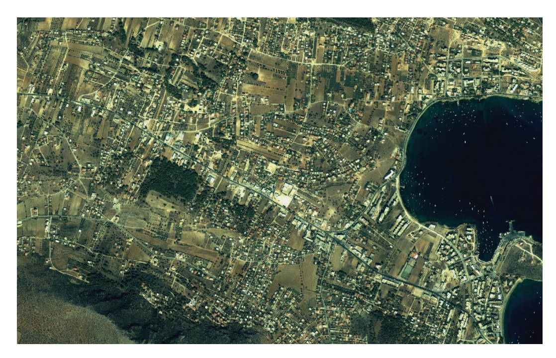
Figure 3: Attika, Porto Rafti: A typical case of urban sprawl in the ex-urban space.

As a result, there is an expanded sprawl consisting of networks of legal, residential, or other activity buildings within the rural space surrounding the conurbations. The evolution of the Greek city of today is increasingly tending to adopt new urban structures that could be easily described as low-density quasi-urban–rural settlements, allocated in zones of high attractiveness, such as the zone next to the city boundary, coastal zones (Fig. 4), as well as in zones along the main road axes where the special building regulation status and relaxations capability benefit urban development [28]. The progressive and unbalanced increase of urban density in these rural or forest land areas creates the conditions for a perceptional paradox: the 'rural city'.