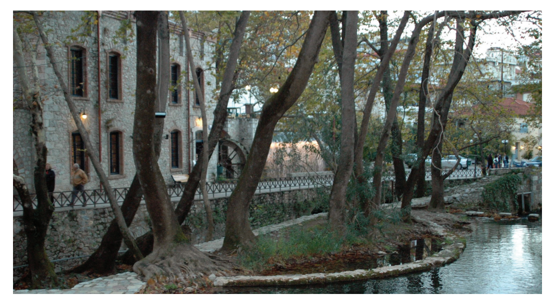
Figure 5: Livadeia, 'Krya' district, 2005. A successful environmental intervention, which aimed to protect the physical environment, to upgrade traditional buildings and monuments as well as to smoothly integrate new facilities for visitors.

In a few cases these natural elements happened to be at the center of integrated urban interventions, thereby reinforcing the 'natural' face of the respective cities (e.g. the restoration and environmental upgrading of Ag. Nikolaos Park at Naousa, the restoration of the surrounding landscape of Chrysopigi Monastery in Chania, the environmental intervention at Krya – Livadeia) [4] (Fig. 5). All the abovementioned actions are examples of the efforts toward alignment of Greek spatial policies with the European directives, which unfortunately are still limited resulting in the considerable lag in this direction [32].