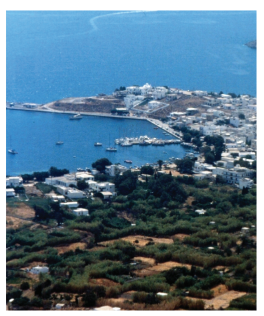
Figure 4: Island Serifos: Comparative comparison of the situation in 1963 (left) and 1990 (right). The idyllic and peaceful landscape is gradually replaced by scattered, unplanned, and unorganized residential, tourist, and vacation facilities.

in agricultural or forest land, especially for the Aegean Islands. Nevertheless, to date they have not managed to act as a pilot for a wider planning and institutional reformation.