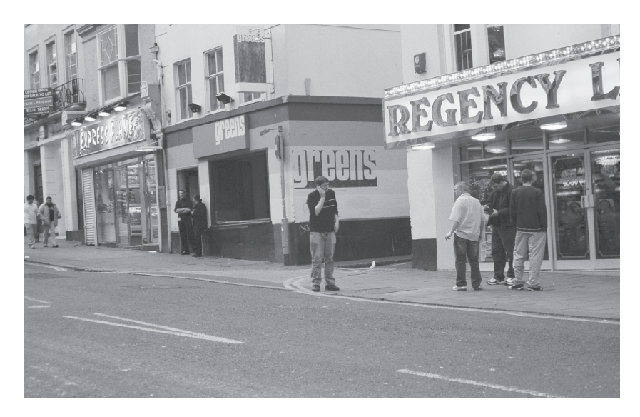
Figure 2: Concentration of venues in Brighton's West Street.

In attempting to ascertain the extent of growth a distinction was made between the evening and night-time economies because it could have been possible for a locality to have been experiencing a growth in late night activities, after midnight, and not in evening activities, defined as before midnight. No authority made a response that indicated a growth in their evening economy without a commensurate rise in their late night economy. This is supported by national statistics which record that of the 113,000 on-licensed premises currently in England and Wales, 12,200 have Special Hours Certificates that permit them to open beyond the terminal hour of 11 p.m. Premises with Special Hours are not, however, widely dispersed across the country, but often clustered together. For example, Westminster City Council, which includes London's West End, the capacity of premises with late licenses in their 'Stress Areas' (West End, Edgware and Queensway/Bayswater) in 2003 was 63,679 with a closing time of 1 a.m., 20,385 with a closing time of 4 a.m. and 12,529 at 6 a.m. [30].