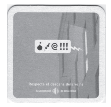
Figure 4: Coaster used as part of noise campaign, Ajuntament de Barcelona, 2002.