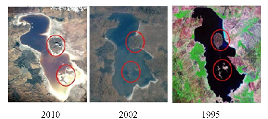
Figure 3: Orumieh Lake's condition 1995–2010.

Increase of sediments in estuary of rivers in past decades and critical fall in the water level have caused the spread of water in flatlands and a problem for rivers that end in the lake. The consequence is the water evaporation and simple water exit.