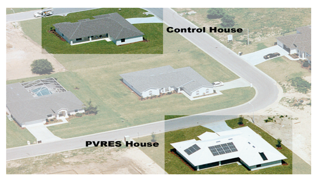
Figure 4: The Lakeland PVRES project.

The building envelope of the PVRES house features a 77% reflective white concrete tile roof. The control home's roof is made of conventional, 7% reflective gray asphalt shingles. When the outside