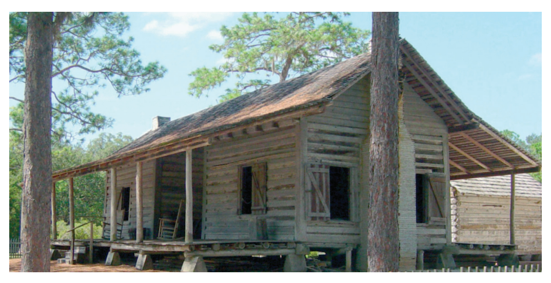
Figure 2: The widdon cabin.

The widdon house has a symmetrical layout with two 5.1 m square rooms and a 3.6 m wide dogtrot between them. Residents had to go outside when moving from room to room, reinforcing their connection with the surrounding environment. Breezes passing through the dogtrot create a negative pressure that pulls air out of the rooms, inducing natural ventilation through the house. A 3 m wide porch runs the entire length of the house on the North and South sides, creating a sense of spaciousness while providing outdoor living and work areas for the residents.