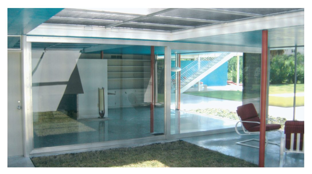
Figure 3: An indoor/outdoor space in Twitchell Rudolph house.

Florida to redefine Florida vernacular in a way that celebrated the region's environmental assets and responded to its climatic challenges.