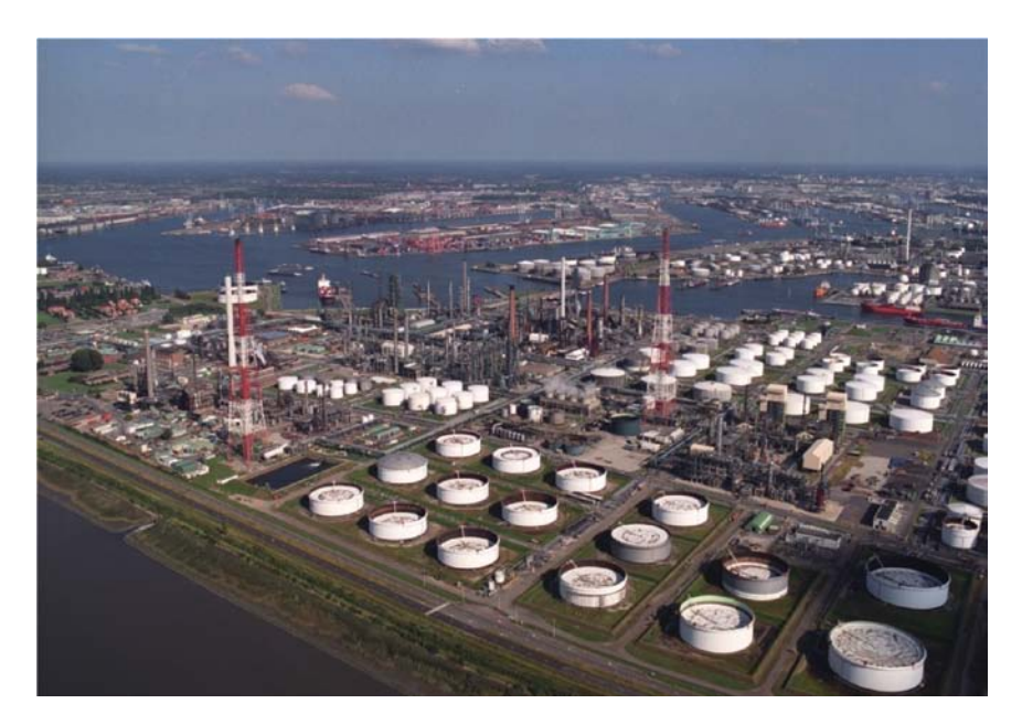
Figure 1: A part of the Antwerp-Rotterdam chemical cluster region.

drivers and partner characteristics in vertical and horizontal collaboration within the Antwerp–Rotterdam chemical cluster region. If we are able to determine these collaboration drivers and partner features, we can formulate recommendations on how to enhance cooperation in general and safety and security collaboration in particular within a chemical cluster.