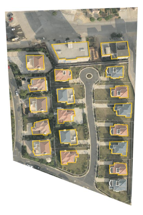
Figure 2. Building extraction example

In order to further validate the proposed method, the DP (detection performace) and BF (branching factor)[] was used to evaluate the performance of the proposed method. Many researchers use these definitions to report the efficiency of their methods. These are