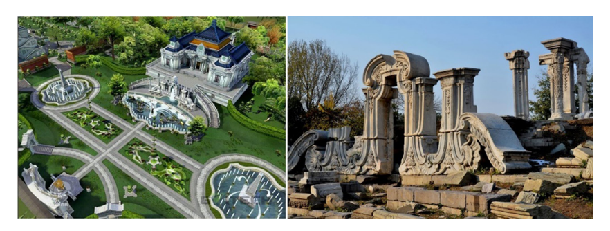
Figure 6: Dashuifa (Recovery View) (Dashuifa, [12]).

unit called 'Shi Chen' was constructed to control the water feature and was set at two-hour intervals; another setting was set at 12 Shi Chen, a period of the day. During each two-hour interval one of the twelve Chinese zodiac animals sprayed water from its mouth; all twelve Chinese zodiacs sprayed water at meridian hour. This combinational fountain was designed as a water clock fountain. These unique features made the Imperial Gardens prime property that was not only costly, but also highly sought after by the ruling class. Dashuifa (Fig. 6) was another large-scale fountain and featured a special viewing deck on the opposite side of the general viewing area for imperial family members. Another feature was the Huanghua Zhen (Fig. 7) labyrinth for imperial entertainment: imperial members commanded eunuchs or maids to walk the labyrinth as directed.