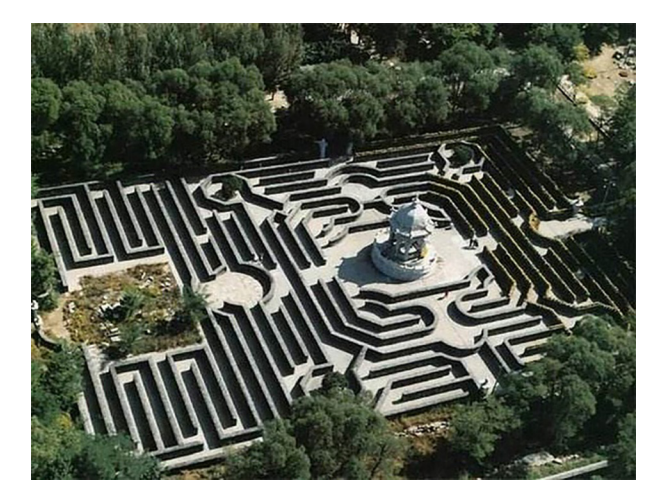
Figure 7: Huanghua Zhen (Recovery View) (Image of Huanghua Zhen, [13]).