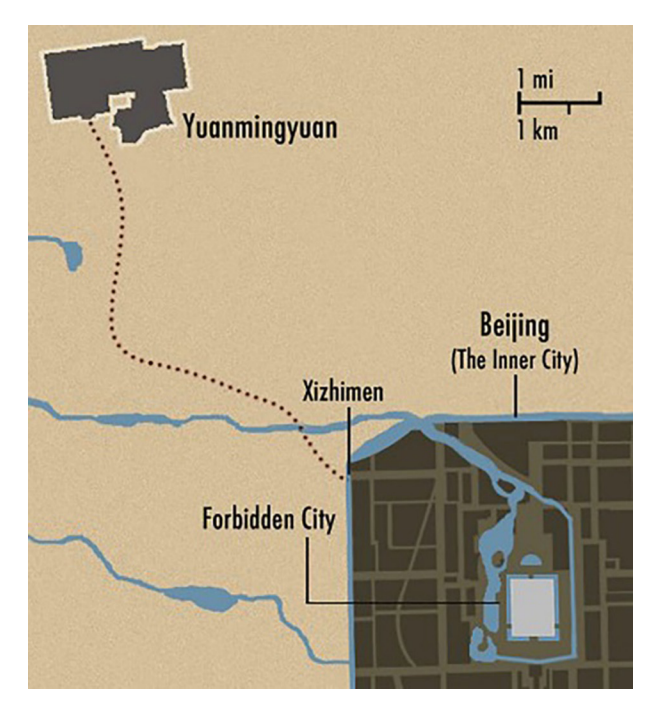
Figure 1: Distance between Yuanmin Yuan and the Forbidden City (M.Li [1]).

These two gardens were completed under the supervision of Emperor Qianlong and Yangshi Lei; the latter was a member of a family who designed imperial architecture. The development of Yuanmingyuan peaked during these three emperors' reigns. Western architecture was introduced to the Elegant Spring Garden along with ancient Chinese style architecture characteristic of European style fountains and palaces (Musillo [2]). A set of paintings, the Forty Scenes