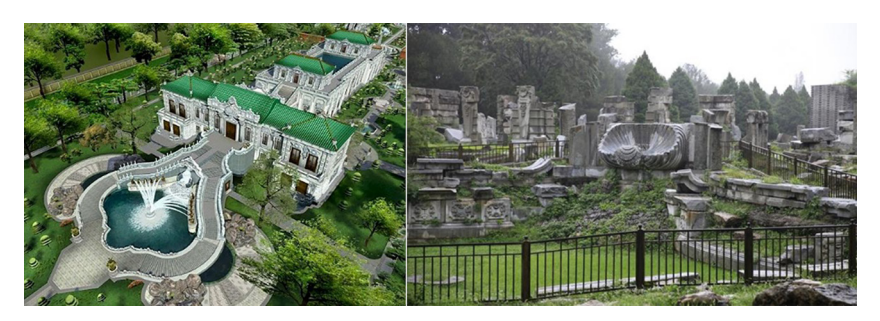
Figure 4: Haiyan Tang (Recovery View) (Image of Haiyan Tang, [10]).