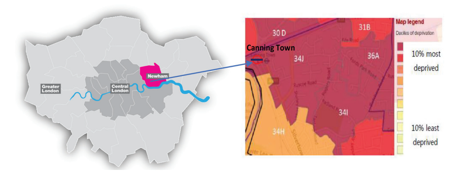
Figure 3: Integrated deprivation level of Canning Town in 2015.

the desk-based assessment was based on collecting and assessing government published data and regularly conducted research and surveys for the borough, as well as key policy documents. Borough, ward (i.e. Canning Town South), and LSOA (Lower Layer Super Output Area) data were used to assess the impacts at multiple scales. In particular, LSOA data are used to identify the least deprived (i.e. 34 H) and the most deprived areas (i.e. 34 I and 36 A) within the studied area to measure the equitable distribution of benefits and negative externalities (see Fig. 3). To identify changes over time, various time periods of data were used.