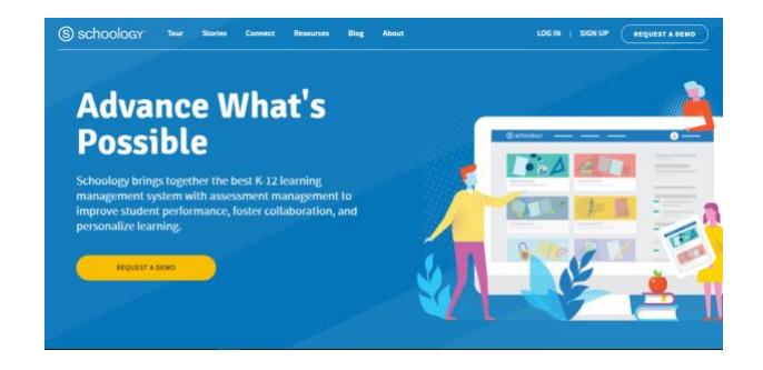
Figure 1. The homepage of schoology apps

Schoology is an educational media that is very promising to meet current and future challenges, especially the problem of teaching in 21<sup>st</sup> century [21]. Schoology is a website that combines e-learning and social networking [22]. This social website offers classroom learning and easy to use [23]. The homepage of schoology apps is as follows.