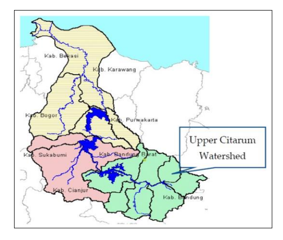
Figure 1. Map of Citarum Watershed

This research was conducted in the vegetable production centers of West Java Province, namely Bandung and West Bandung districts. Both districts are located in the Upper Citarum Watershed (Figure 1). In Bandung, the research locations were spread across 14 villages and 9 sub-districts, while in West Bandung, in 8 villages and 5 sub-districts.